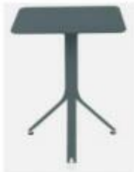
Fernob Resto 570x570mm Metal - Colour Storm Grey