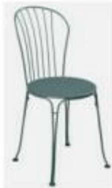
Fernob Opera Metal - Colour Storm Grey