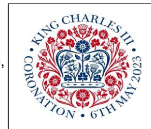
Proposed stencil for colouring activity and wildflower seed packets scheme (Project b and e)

We would also need to factor printing costs for any design chosen. Which would be up to £150.