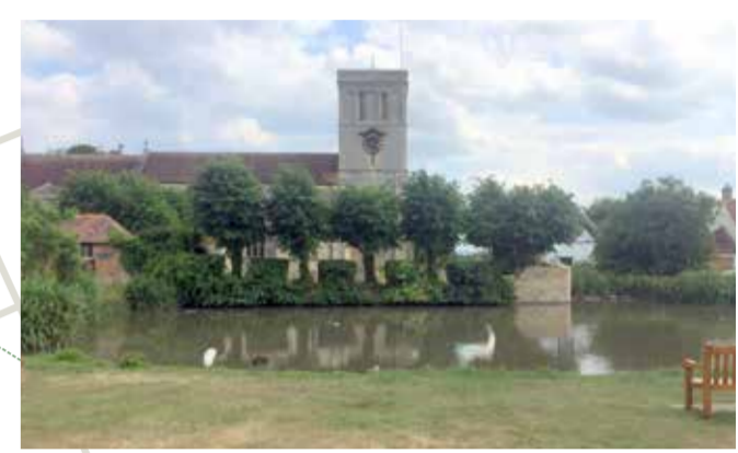
Haddenham Church End