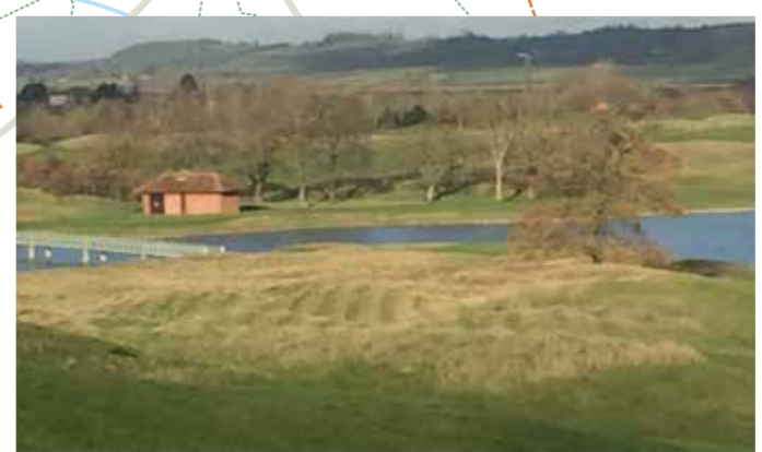
Oxfordshire Golf Course

See reverse for detailed descriptions of the three sections of the Thame Outer Circuit.