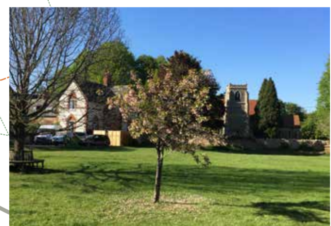
Towersey village green