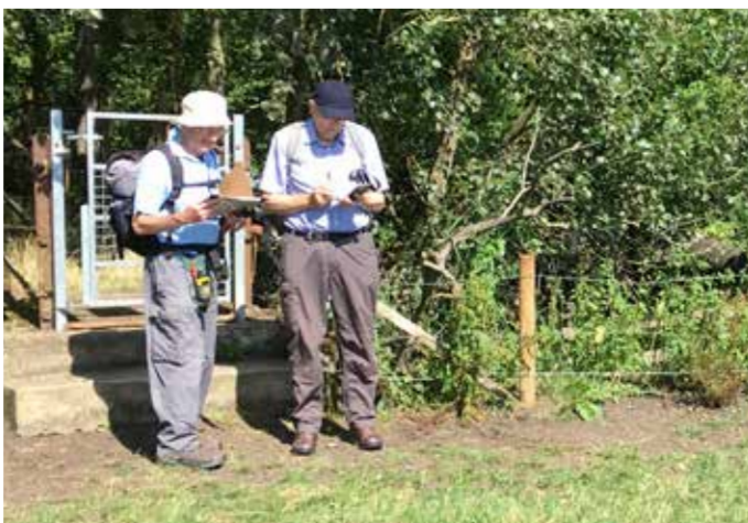
Consultation near Long Crendon

6. Now follow the road to the left to cross several bridges and past a signpost for the Thame Valley Walk on the right (Section 2 starts from here). Continue on the road for about two thirds of a mile to reach a main road (A418). Just to the right is a bus stop from which you can get a 280 bus back to Thame.