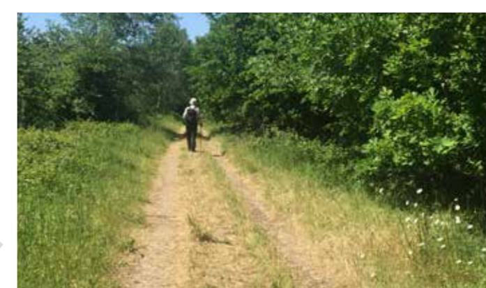
Along the old railway track