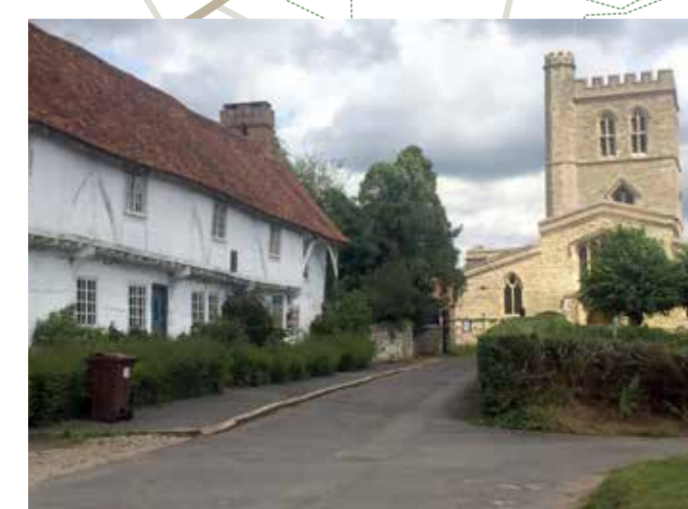
Long Crendon Church and Courthouse