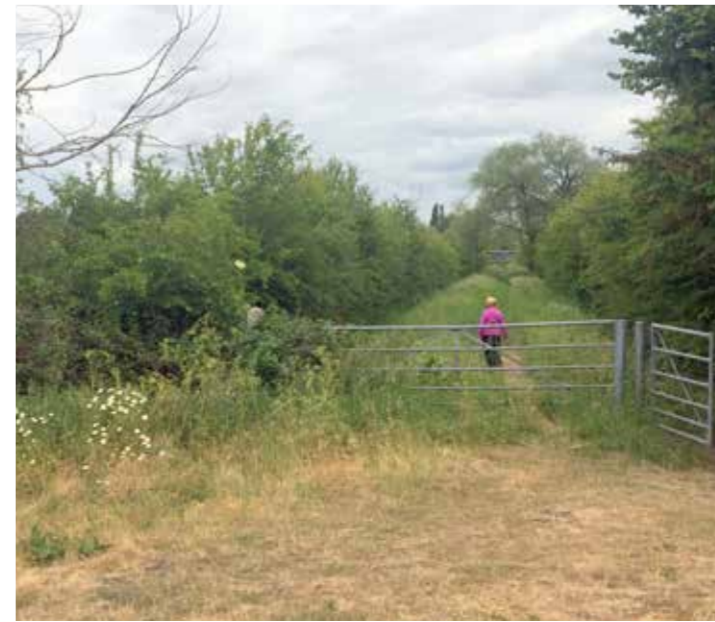
Crossing the Phoenix Trail near Towersey

It is possible to take a 280 bus from here to Thame.