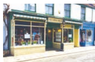
THE COFFEE HOUSE