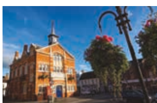
THAME TOWN HALL