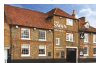
THE SWAN HOTEL