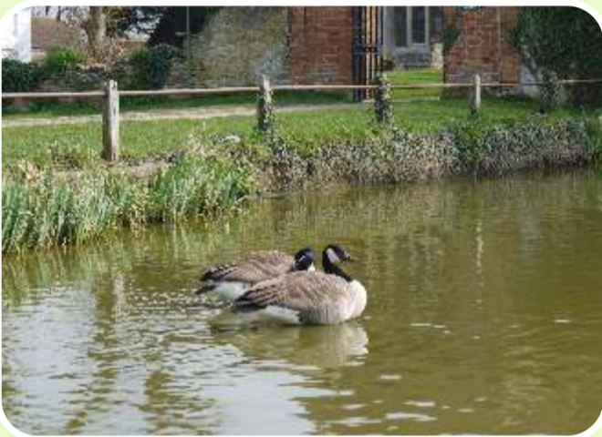
The village pond, Haddenham