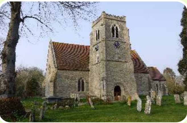
St. Catherine's Church, Towersey