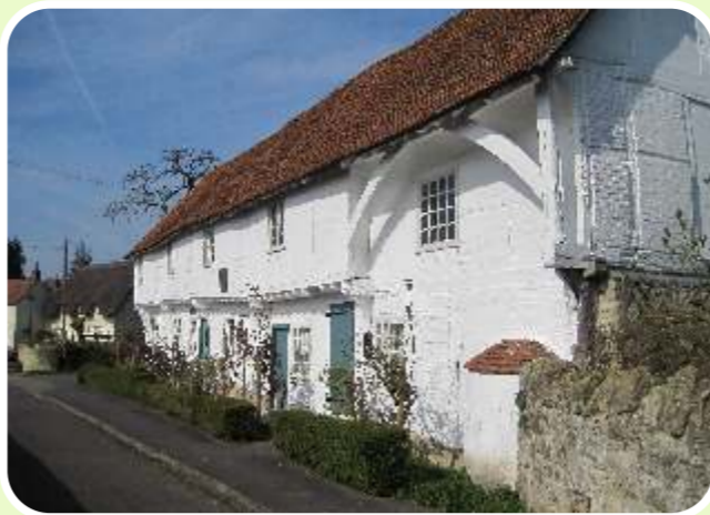
The Courthouse, Long Crendon