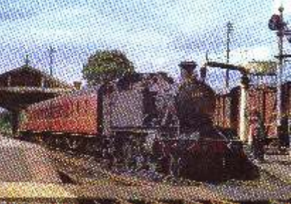
The station in 1962

rest of the GWR it became standard gauge in 1871. Passenger services ceased between Princes Risborough, Thame and Oxford in 1963, although freight services continued to Thame until 1991. Sadly the roofed structure of